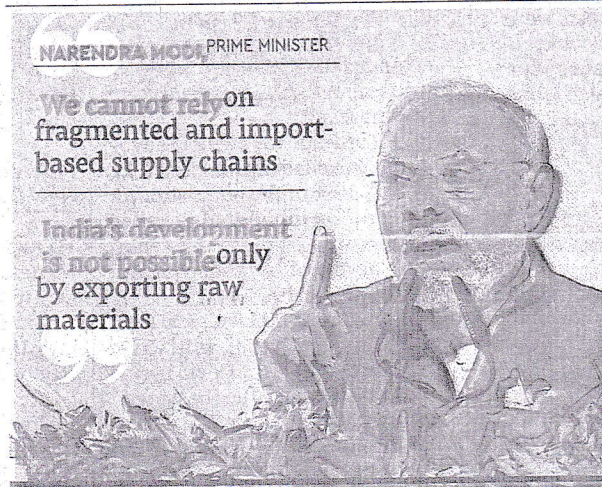
NARENDRA MODI, PRIME MINISTER

Inaugurating the 'Utkarsh Odisha, Make in Odisha Conclave' in Bhubaneswar, Modi also underscored that India must seamlessly integrate itself with the global supply chains, amid geopolitical uncertainties and a