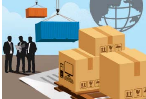
ILLUSTRATION: AJAY MOHANTY

Samsung, which has been operational in India for over a decade, has also begun mobile exports under the PLI scheme, along with some Indian companies which are exporting smartphones in relatively small numbers.