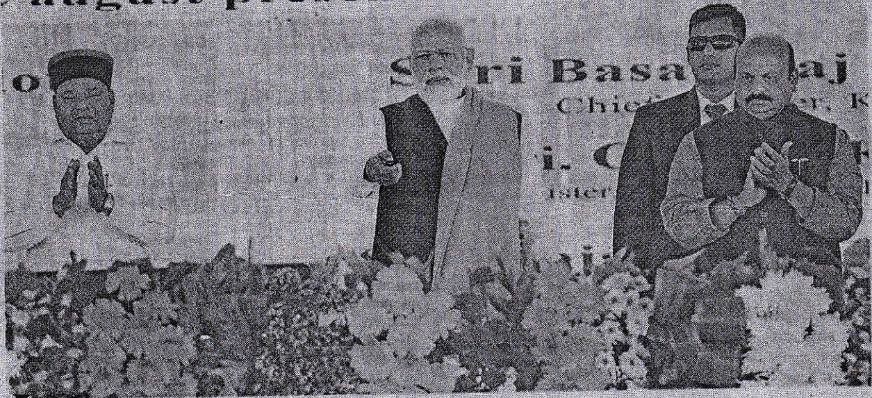
BREAKING GROUND. Prime Minister Narendra Modi inaugurates the ₹4,699-crore Narayanapura Left Bank Canal extension and renovation project; and the ₹2,054-crore Yadgir multi-village drinking water scheme and laid the foundation stone for the Surat-Chennai Expressway, which includes a six-lane greenfield stretch from Akkalkot to Kurnool. Modi is flanked by Karnataka Governor Thawar Chand Gehlot (left) and Chief Minister Basavaraj Bommai (right).