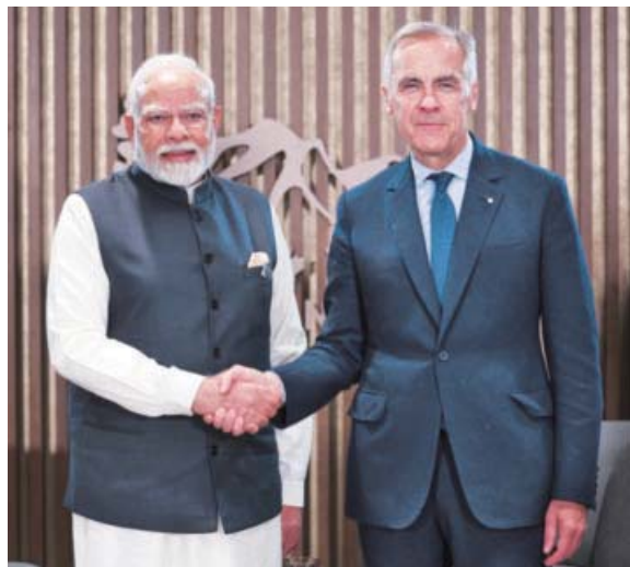
Prime Minister Narendra Modi with his Canadian counterpart Mark Carney on the sidelines of the G7 Summit in Kananaskis, Canada