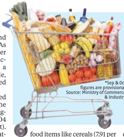
*Sep & Oct figures are provisional

food items like cereals (7.91 per cent), paddy (7.47 per cent), pulses (9.74 per cent), and milk (3 per cent) also witnessed slight deceleration