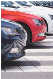
August vehicle sales (in units)