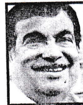
NITIN GADKARI UNION ROAD TRANSPORT AND HIGHWAYS MINISTER

It is a need of the hour that the auto industry's innovation for greener alternatives attains a new momentum and also help in making India self-reliant.