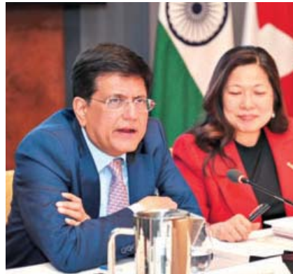
Commerce and Industry Minister Piyush Goyal (left) and his Canadian counterpart Mary Ng at the CEOs round-table in Toronto on Wednesday

“The deal will cover commitments in goods, services, investment, rules of origin, sanitary and phytosanitary measures, technical barriers to trade,