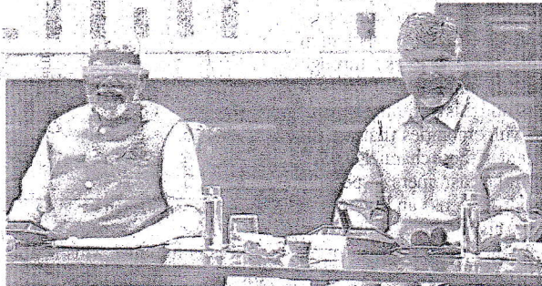
LOOKING FOR FUNDS. A file photo of PM Narendra Modi with AP Chief Minister N Chandrababu Naidu

Naidu, who was recently in Delhi to meet important ministers in the Union government, has sought substantial financial support to help reconstruct Andhra Pradesh. He had also met Finance Minister Nirmala Sitharaman. There is expectation that Sitharaman may offer something to the State when she presents the Budget on July 23. According to the buzz in the corridors of