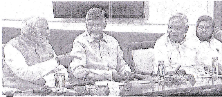
PACKED AGENDA. Prime Minister Narendra Modi with key allies TDP chief N Chandrababu Naidu, JD(U) chief Nitish Kumar and Shiv Sena (Shinde) chief Eknath Shinde during the NDA meeting in New Delhi

The need to focus more on grassroots issues such as protecting jobs and preserving livelihoods coupled with pressure from certain coalition partners on protecting sensitive sectors, such as agriculture and vulnerable industries, may push the BJP-led NDA government to switch gears and even change tracks, some trade analysts say.