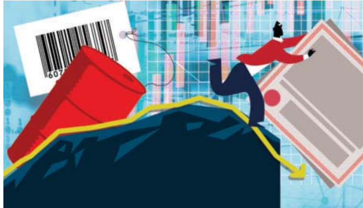
ILLUSTRATION: BINAY SINHA

The issue of listing India's bonds globally has been a contentious one, with disagreements over taxation issues